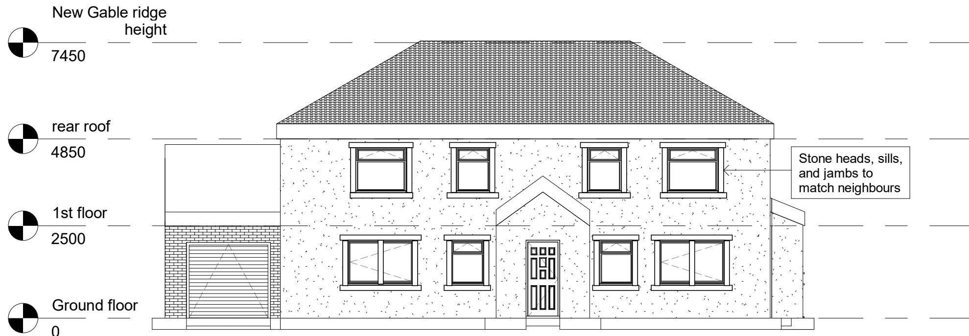
1 Front 1 : 100