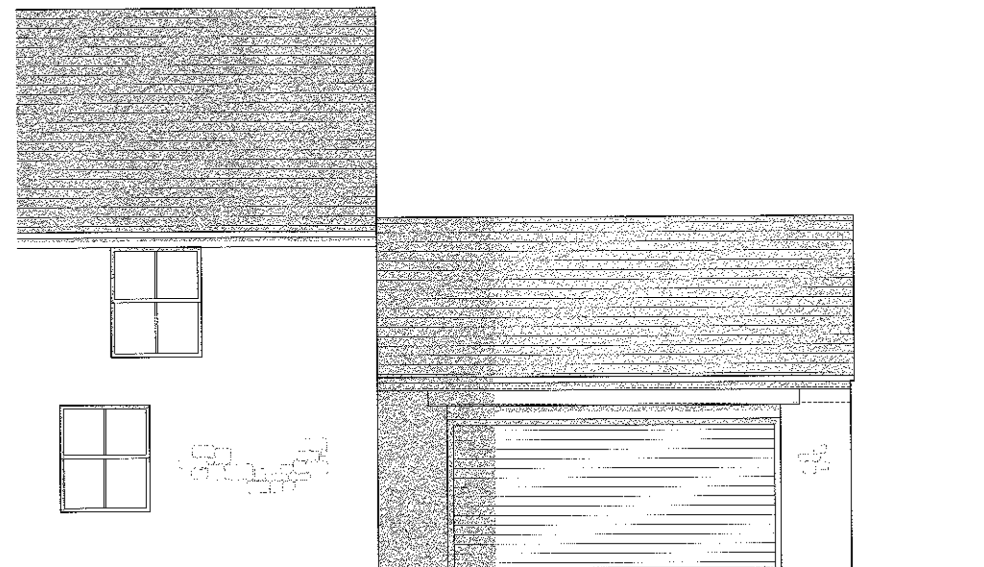
Existing Part South East Elevation Scale 1:50

This drawing is to be used in conjunction with all relevant Architect, consultants' and specialist drawings and specifications. The Architect is to be notified of any discrepancies before proceeding. Do not copy from this drawing. All dimensions and levels are to be checked on site. This drawing is subject to copyright. All work carried out before Planning and Building Permission has been granted is at the contractor's risk.