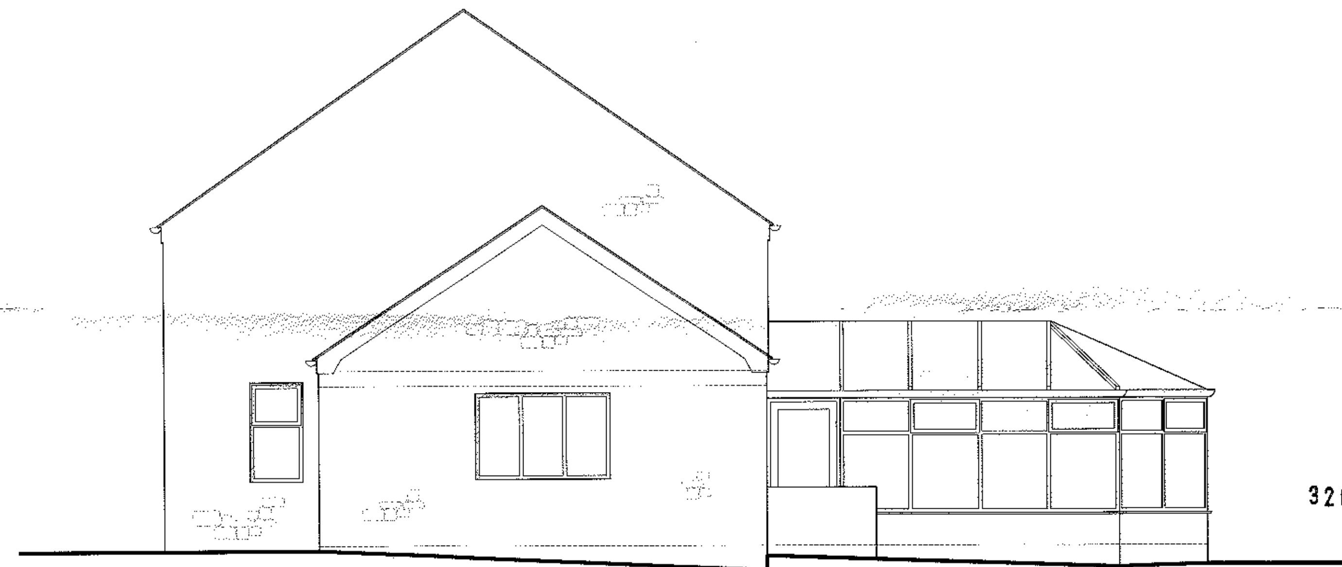
Existing Part North East Elevation Scale 1:50